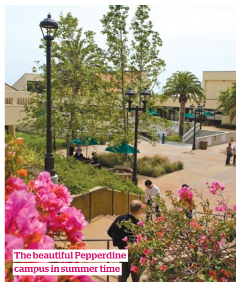
The beautiful Pepperdine campus in summer time

All excursions include a tour segment and some allocated shopping time (where available). Excursion entrances are included where shown on the timetable above. All excursions are led by Kings members of staff. Alternative excursions and entrances may be available upon request – contact Kings Summer for details.