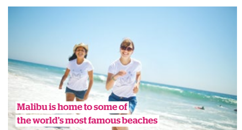
Malibu is home to some of the world's most famous beaches